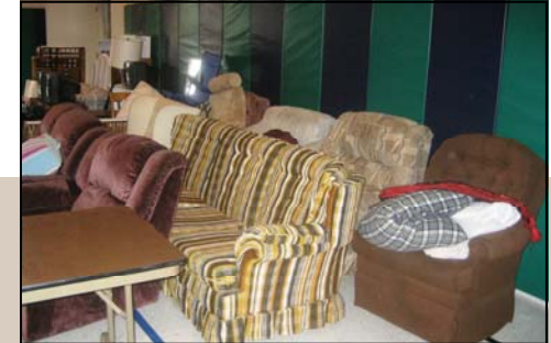
Furniture donations from area college students

Over the last 11 months, Bethany for Children & Families has been part of an effort to move used, but usable beds and furniture items to homes of families that required assistance. Foster homes, newly acquired living spaces for families relocated after domestic violence, as well as families new to the area, during this period of economic downturn, all benefitted from the generosity of the community.