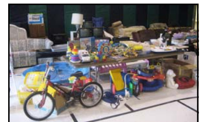
Donations to be given to families in need