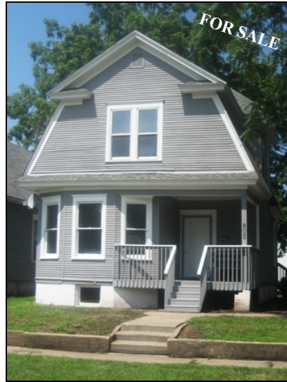
805 12th Avenue, Rock Island Offered at: $49,900

Do you know someone interested in this spacious three bedroom, one bath home with over 1,100 square feet of living space? It features a large backyard perfect for a family barbeque, lots of storage space, fresh paint, and new flooring throughout. Updates include new electrical, plumbing, furnace, flooring, duct work and vents, window panes, and a newer roof. Plus, the front porch and back deck are brand new!